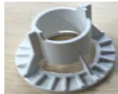
White reduction part code 667806